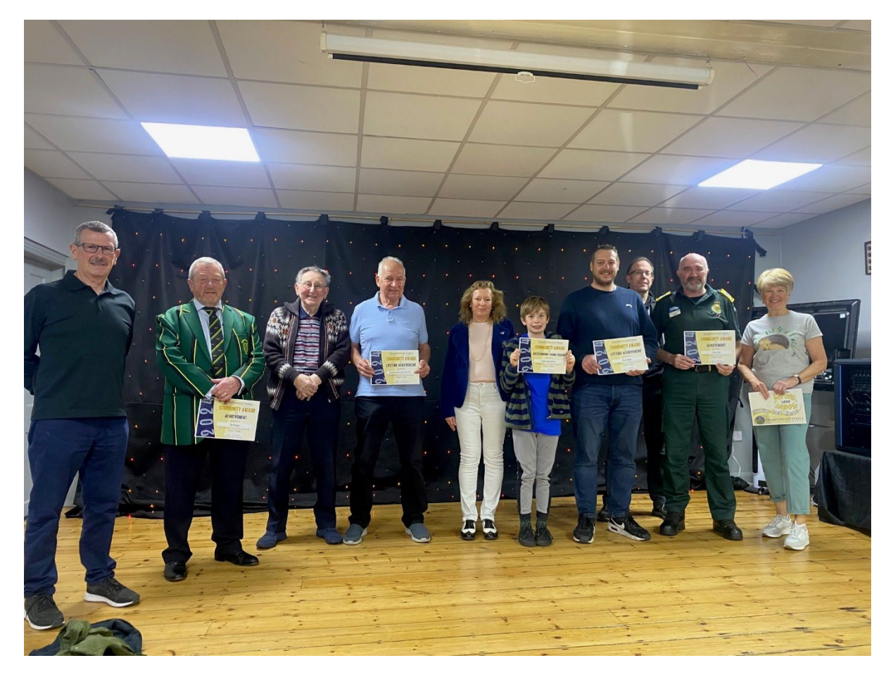
Figure 16: This year's community award winners pose on stage with their award certificates.