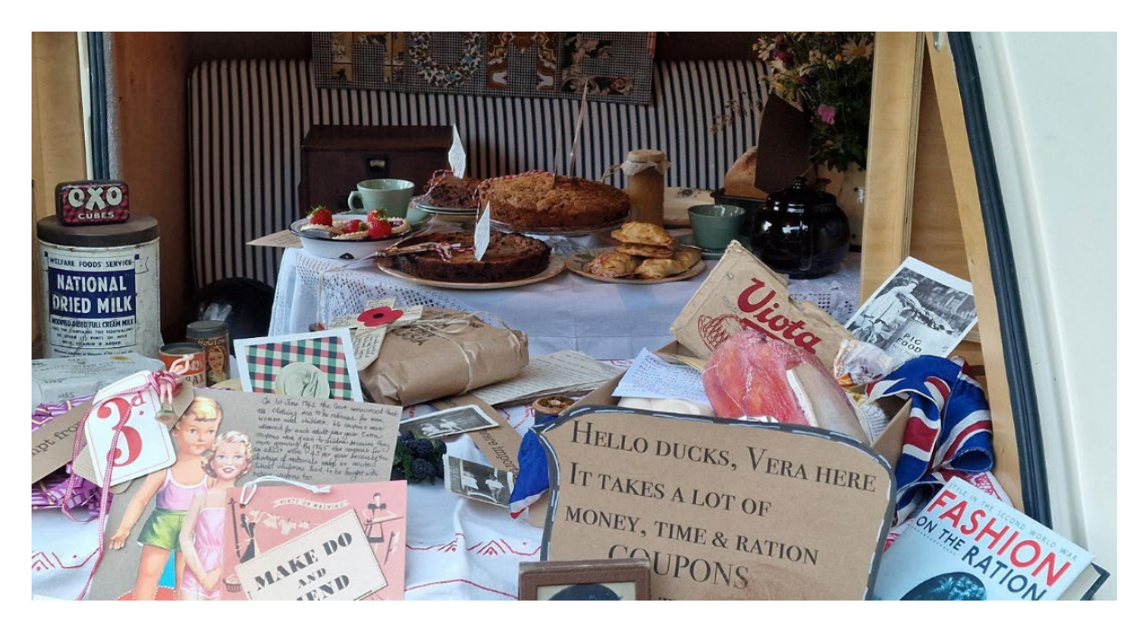
Figure 6: Some exhibits in Liz Ferguson's World War 2 Mini Museum, including examples of wartime food, ration books, and newspaper clippings.