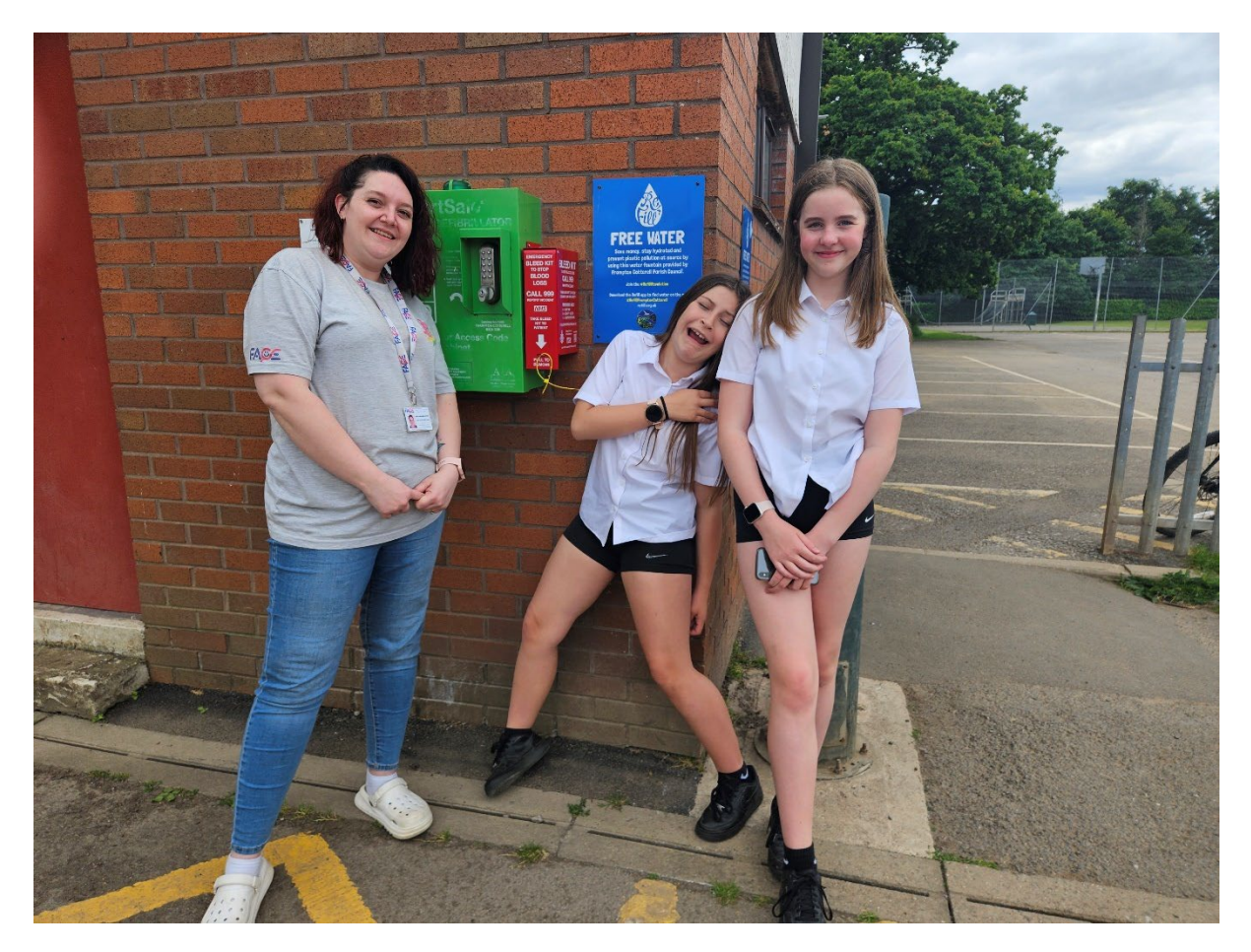
Figure 23: Members of FACE Youth Group and a youth worker pose with the bleed kit at The Pavilion