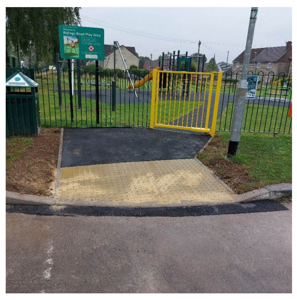
Figure 26: Newly installed drop kerb on the pavement outside of the entrance gate of Ridings Road Play Area