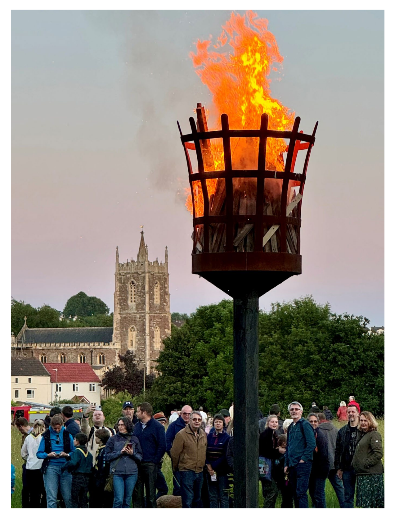
Figure 3: The Centenary Field Beacon burns brightly as a crowd looks on.