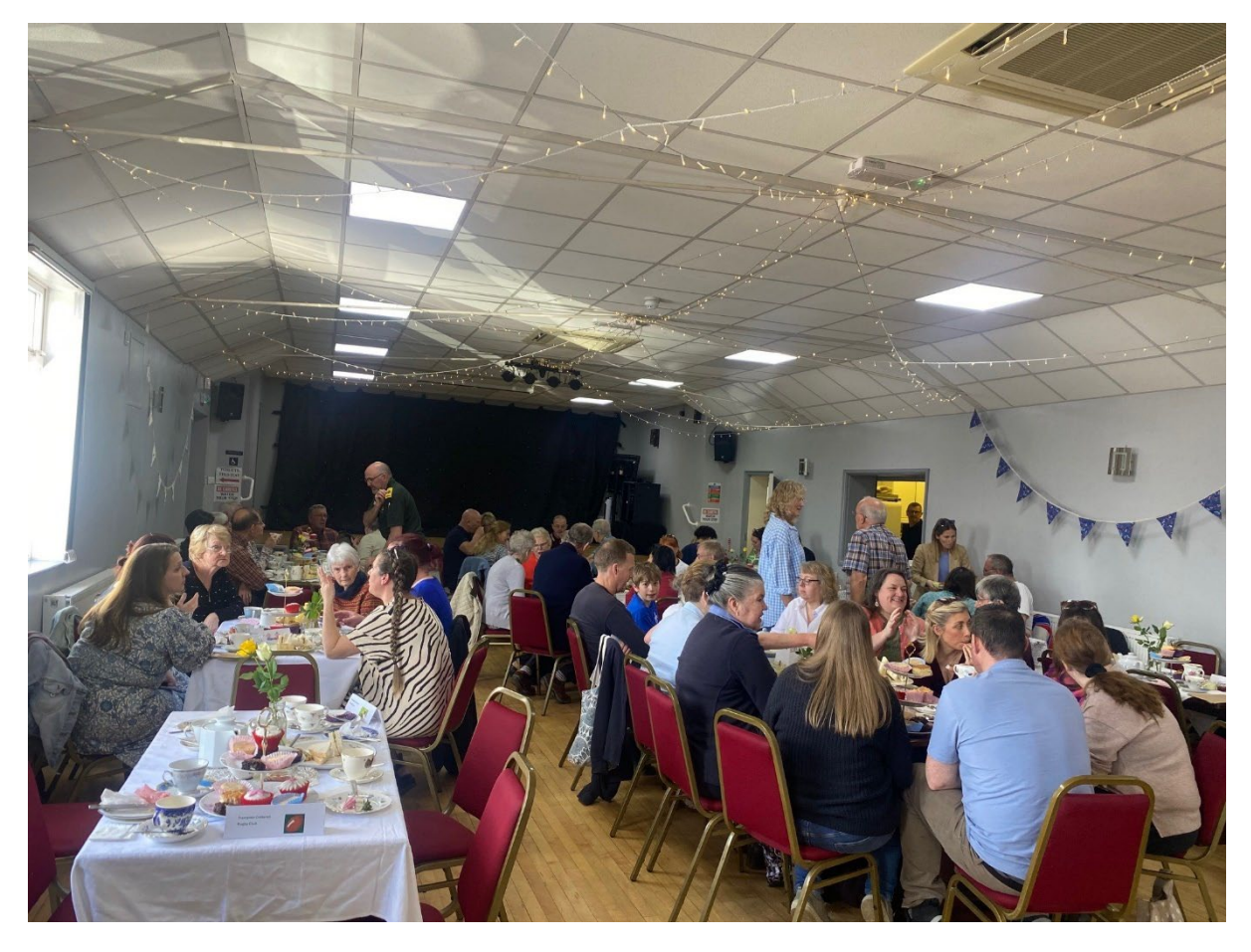
Figure 15: Our volunteers enjoying their cream tea "thank you" at The Miners