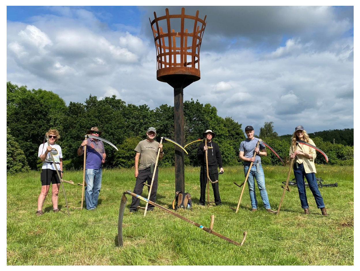
Figure 7: A group of five volunteers and our Climate & Nature Office pose with their scythes in the freshly scythed area around the Centenary Field Beacon.