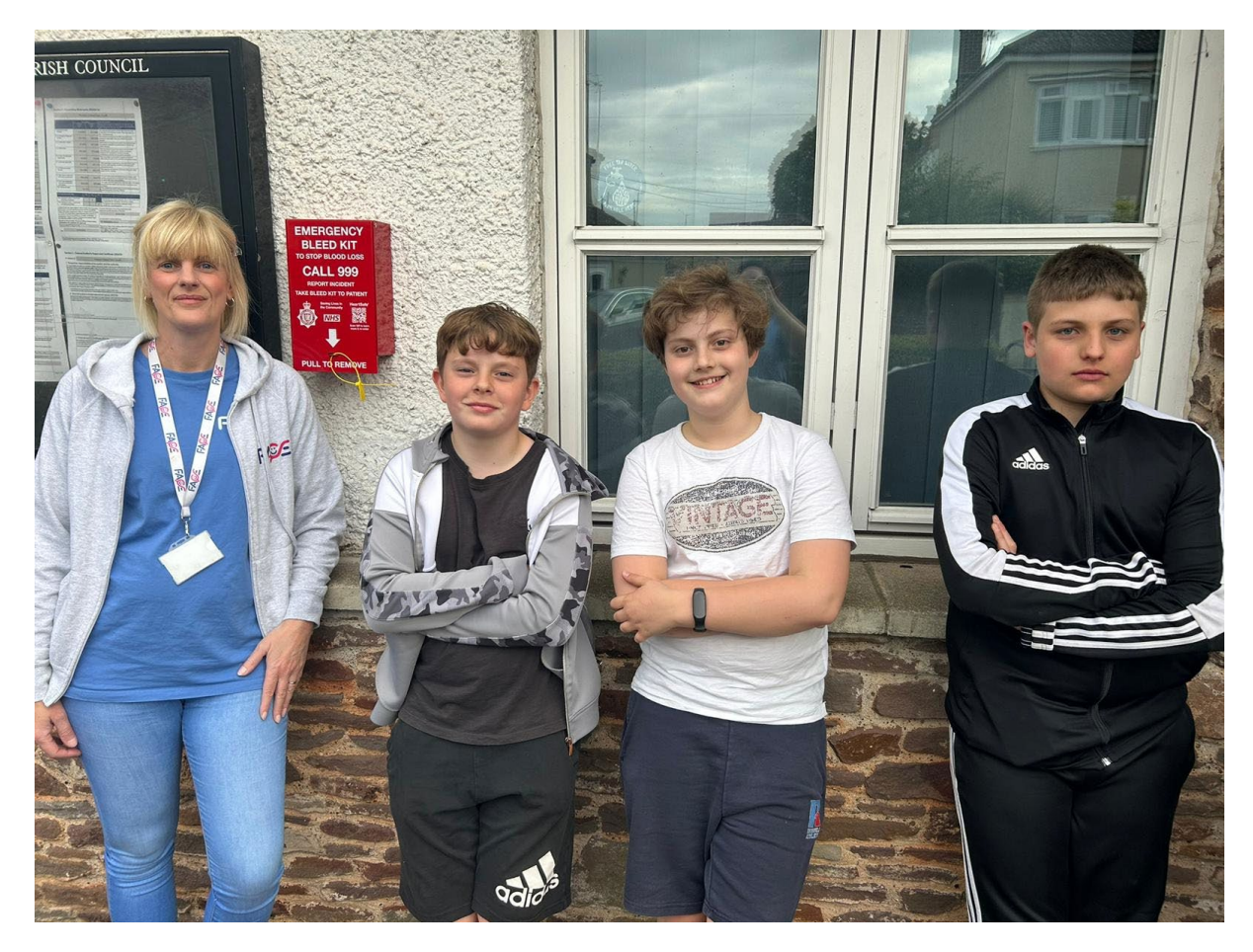
Figure 22: Members of the FACE Youth Group and a youth worker pose with the bleed kit at The Brockeridge Centre.