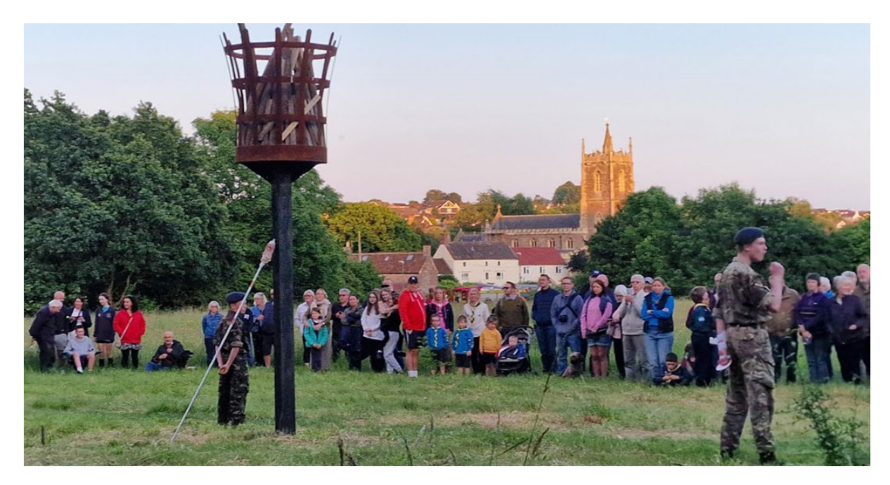
Figure 4: Air Cadets stand guard around the beacon at Centenary Field.