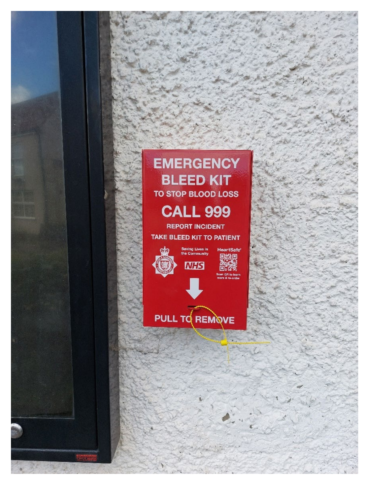
Figure 25: Bleed kit at The Brockeridge Centre