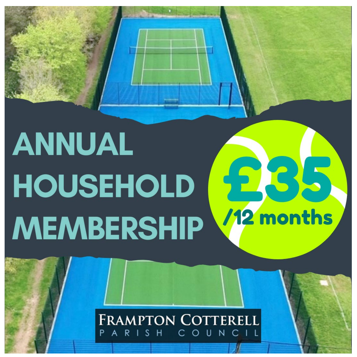
Figure 14: Annual Household Membership, £35 for 12 months.

Frampton Cotterell Parish Council is now trialling an Annual Household Membership Pass for the tennis courts.