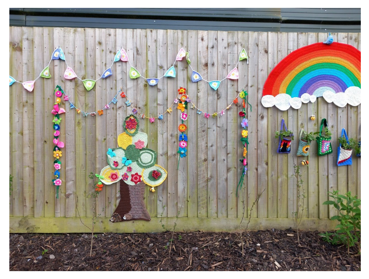
Figure 27: Yarn Bombing by the Crochet & Knit Club on the Brockeridge Centre fence.