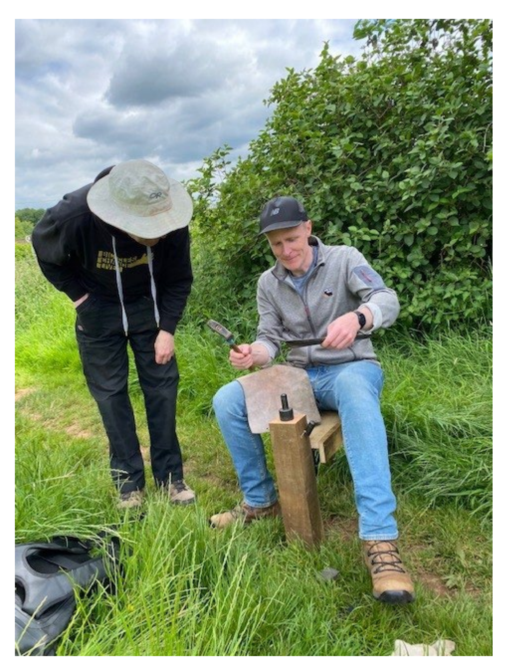
Figure 8: A volunteer watches on as a scyther "peens", or sharpens, a scythe.