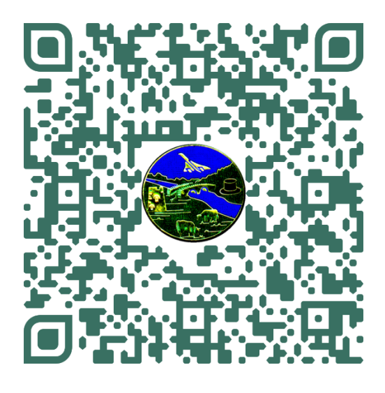
Figure 28: QR Code to Frampton Cotterell Parish Council website page for more information on the exhibition

To learn more, scan the QR Code (below) or visit our website, at <u>www.framptoncotterell-pc.gov.uk/climate-nature-art-exhibition-2024</u>