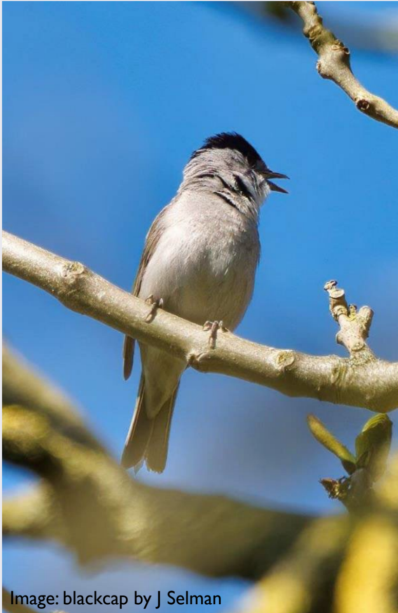
Image: blackcap