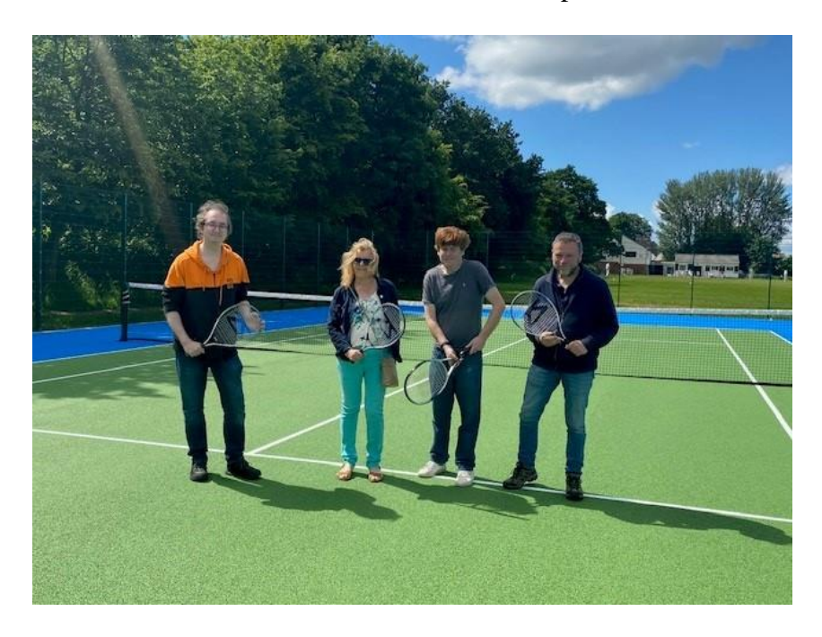
Winner of the Colouring Competition -1^{\rm st} Prize an annual family membership, set of tennis balls and a Chilli's water bottle