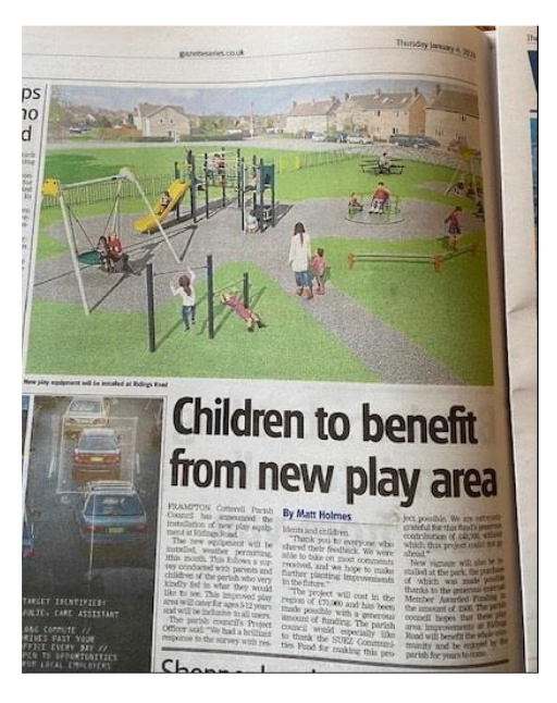
Yate & Sodbury Gazette, January 2024 edition

On December 1st, the Parish Council hosted the 2023 Carols Around the