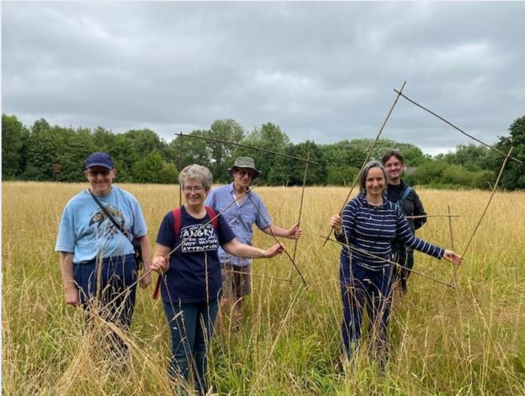
Image:Volunteers conducting meadow monitoring at Centenary Field in July 2022.