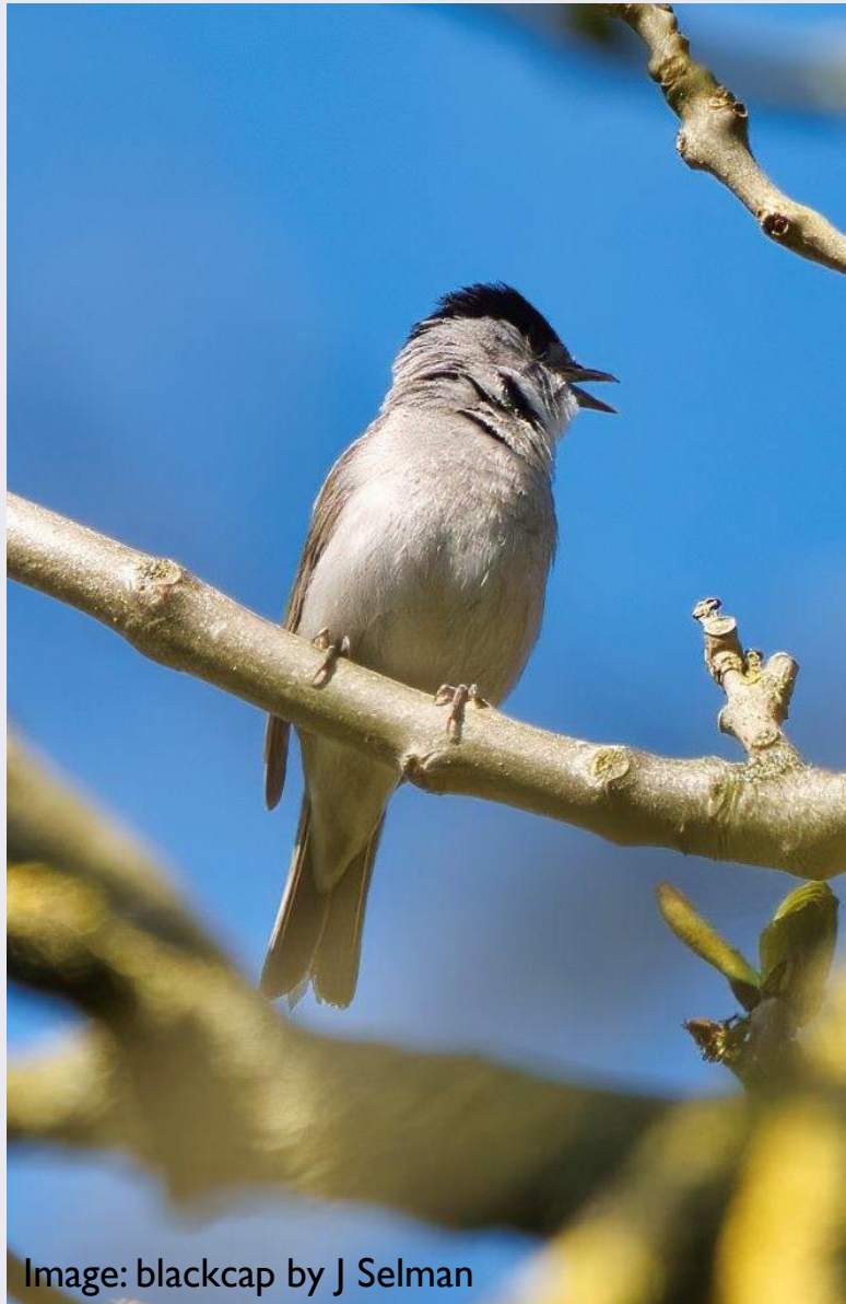
Image: blackcap