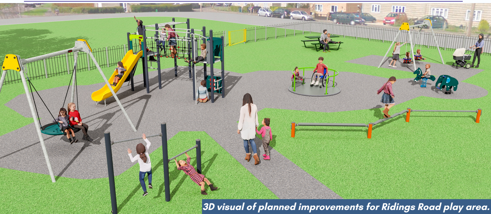
3D visual of planned improvements for Ridings Road play area.