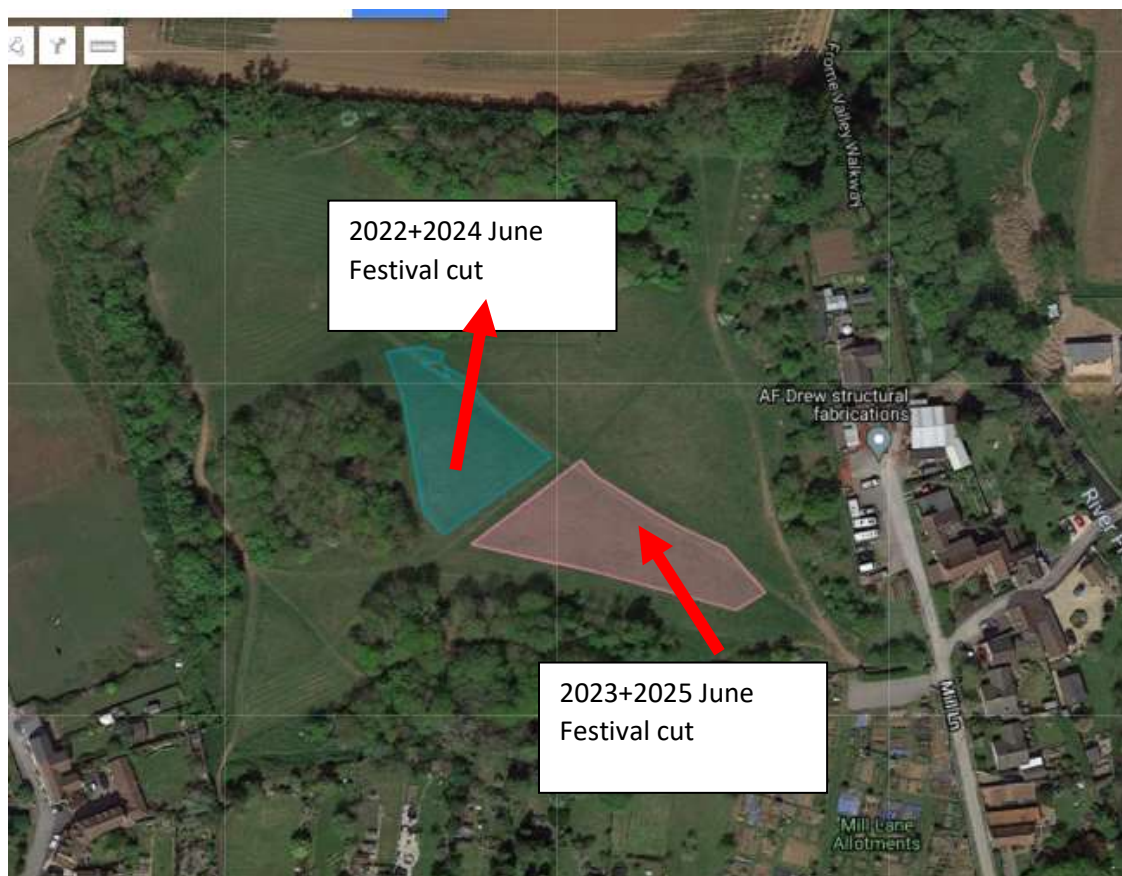
Figure 2: rotational June/July Festival cut